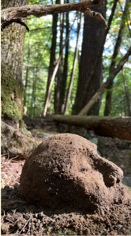
"EPHEMERA: ETERNAL PEACE"