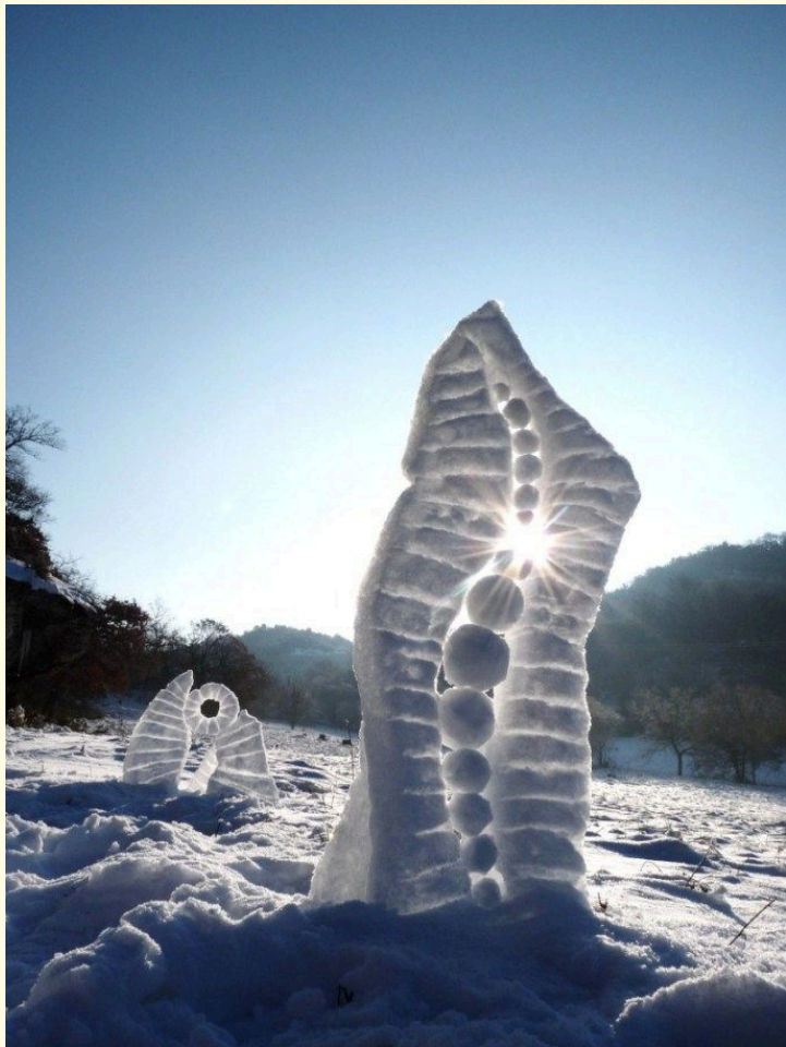
SNOW AND ICE