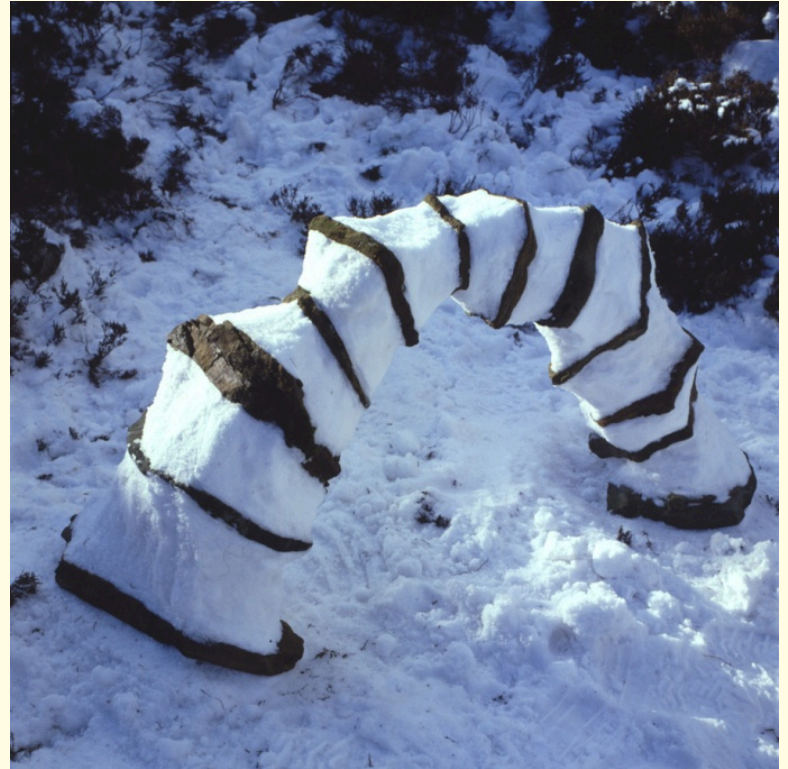
SNOW AND ICE, SLATE