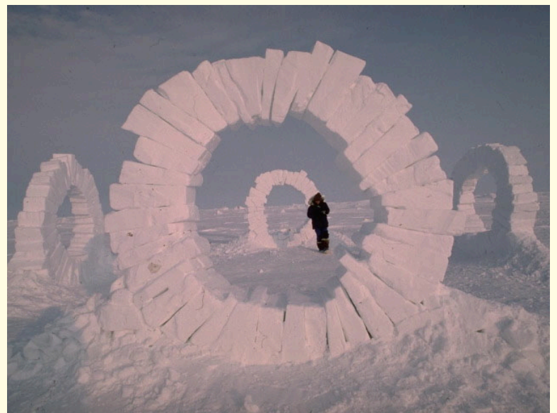
SNOW AND ICE