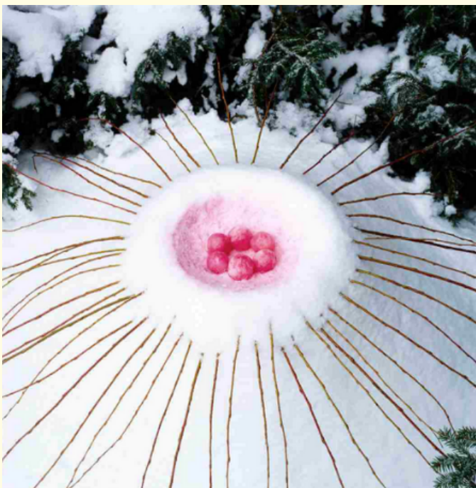
ICE AND SNOW COLORED WITH VIBURNUM JUICE, WILLOW WITHIES