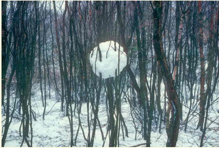
SNOW AND ICE, TREES

Through using materials such as flowers, snow, stone, sticks, and leaves, Goldsworthy's work exemplifies art that has minimal intervention and impact on the natural world.